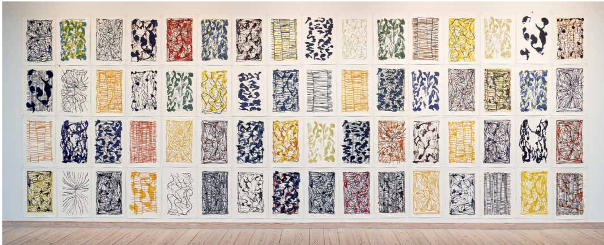
(left) Bjarne Werner Sørensen, Matrix Variations , installation view, Kringsýni , National Gallery of Faroe Islands 2018. Series of unique stone lithographs, each 50 x 34 cm Zerkall 340 gsm paper. Printed by the artist on a Takach press at SVFK.